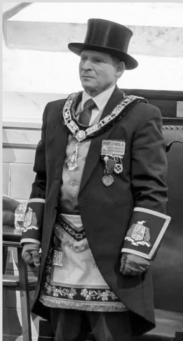
Our 171 st Grand Master for the State of Rhode Island and Providence Plantations