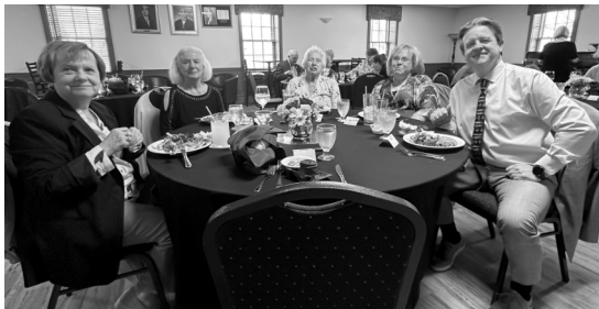
Special Ladies Luncheon