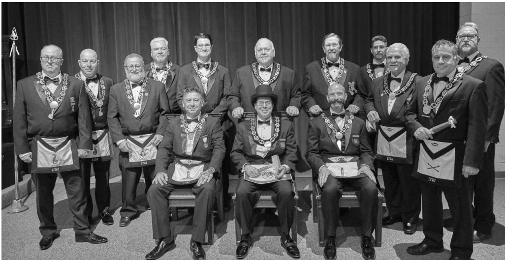
2021-2022 Lodge Officers