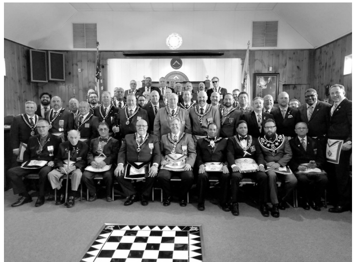
St. Johns & Euclid Lodge 2019